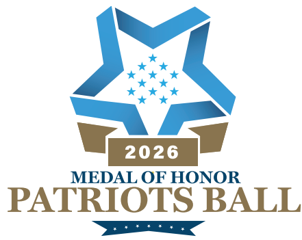
TABLE SPONSORSHIP LEVELS