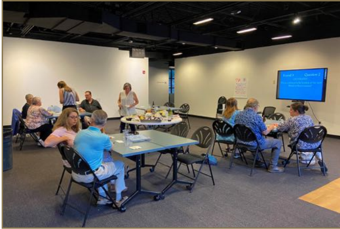
Volunteers and staff enjoy a recent Trivia Night at the Heritage Center

to take what they have experienced and use it to make the world better. These volunteers often find themselves in conversations with children about the values of the Medal of Honor and guide these young minds to find their own values in their lives. Difficult conversations with visitors from around the world can turn into meaningful dialogue about the nation's highest military award and the values modeled by its recipients.